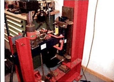
Joint Stiffness test on Beam end connector – Cowen Associates Ltd.

Using the test data, the safe working loads have been calculated based on the steel used in the tests of guaranteed physical properties. The test results and calculations carried out in accordance with the SEMA Code of Practice have been recorded in the GSR reports and are available in the Godrej Technical File for Selective Pallet Racking.