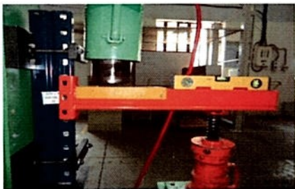
Shear capacity test on Beam end connector - Godrej.

A proportion of the tests were repeated at Cowen Associates Ltd. test facility at Shropshire - UK and at The University of Sheffield – UK.